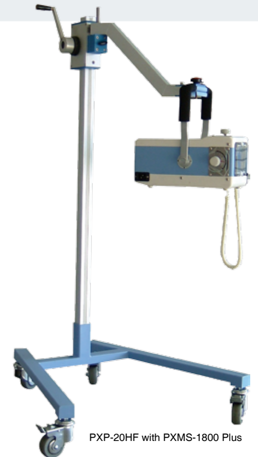
PXP-20HF with PXMS-1800 Plus