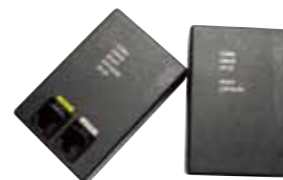
R/F wireless communication