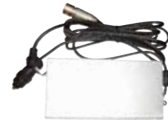
Charging by car jack