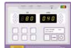
Operation program for PC